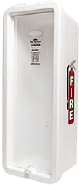
Island Chief 105-5 WWC-P

Cato's affordable fire extinguisher series, manufactured in the U.S, provides a dent and rust proof alternative to metal. Cato's Island Chief series fire extinguisher cabinets feature a security hexagonal lock and key to open and remove the trim and pull panel cover. The acrylic features a hand opening to easily pull panel out to gain access in case of fire.